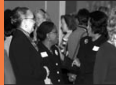
Circle of Women Luncheon with Title Sponsor Huntington Bank

Private, community support allows the YWCA to address operational and emergency needs, participate in valuable strategic initiatives, and fill gaps that would otherwise remain for the women and families that we serve. This year, the YWCA's annual community fundraisers - Circle of Women , Run Jane Run , and TRIBUTE! raised over $140,000.00 (net) to do just that.