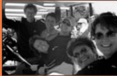
Run Jane Run Women's Golf Tournament & Auction