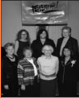
TRIBUTE! Awards Celebration with Title Sponsor Fifth Third Bank